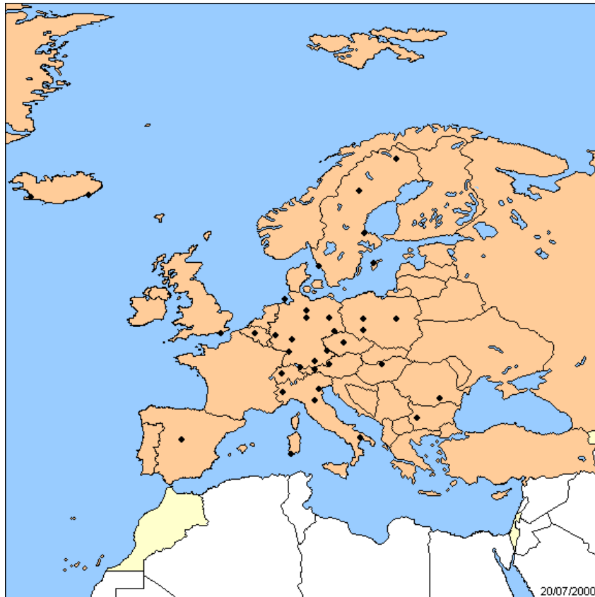
Figure 2 - EUREF stations submitting hourly tracking data

Recommendations of the EUREF AC workshop included :